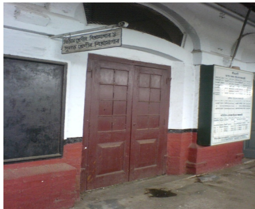
FIGURE 2: WAITING ARRANGEMENT- CLOSED