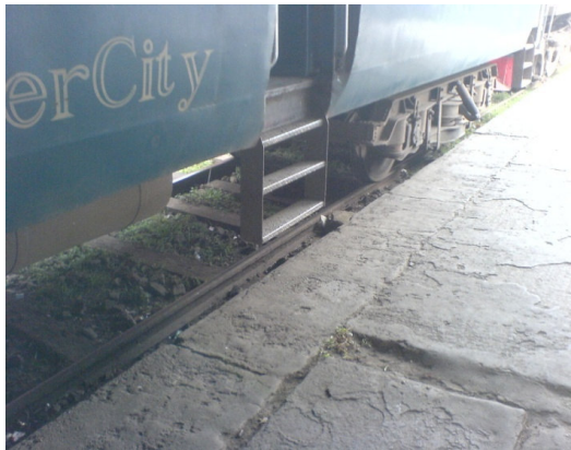
FIGURE 5: HEIGHT BETWEEN PLATFORM AND TRAIN FLOOR IS MUCH