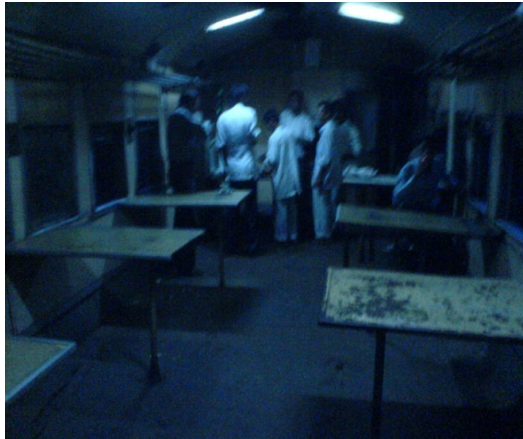
FIGURE 4: NO SEAT IN DINING SPACE