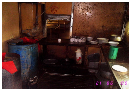
FIGURE 3: VERY UNHYGIENIC KITCHEN