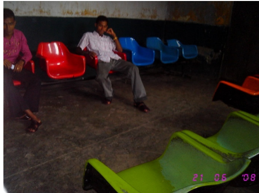
FIGURE 1: WAITING ARRANGEMENT –VERY LOW SEAT CAPACITY

dining space there is no seat with any table. In few stations it have observe that the height of train floor from station platform is much higher than normal range which create problems during uploading, unloading and riding on the train and there is enough possibility to happening an accident at the time of emergency riding like riding on slow running train. Few scenarios of railway service regarding the selective route present through following pictures: