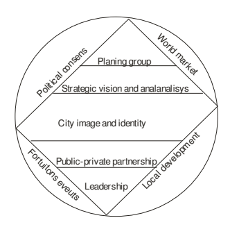
FIGURE 1 - SUCCESS FACTORS OF URBAN MARKETING (SEPPO, 2003)

The other elements (political consensus, world market and local development, fortuitous events) represent the challenges that applications of urban marketing specific procedures have to face.