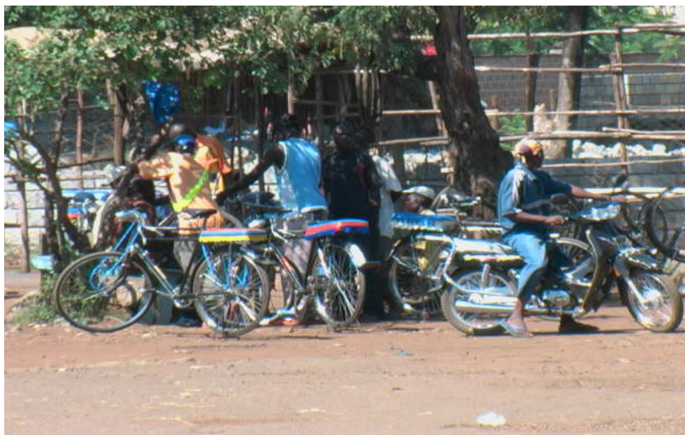
FIGURE 3: BICYCLE AND MOTORBIKE REPAIR STATION AT MAENDELEO PARK

refreshments within its periphery. There were no notable economic activities in Jamhuri Park. Central Park is the smallest among all the Parks and it seemed not to have opportunities for much economic activities due to its size and being located at the heart of Kisumu Town it was seen more as an artistic Park.