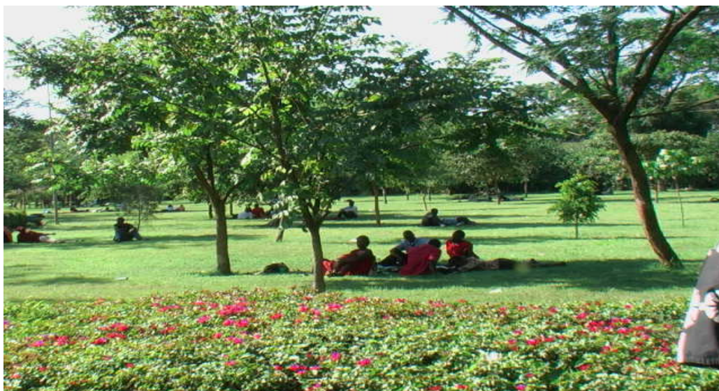
FIGURE 5: PARK USERS RELAXING IN A WELL-MAINTAINED AND ATTRACTIVE JKG

more trees were being grown to improve the environment. JKG had well maintained vegetation and provided plenty of shades for its many users as shown in figure 5. Jamhuri Park although poorly maintained was quiet rich in vegetation. Generally, the parks were underutilized as an environmental resource and as an informational tool that could be useful in dissemination of information to the public through avenues like historical structures, demonstration sites, notice boards, bulletin boards and suggestion boxes.