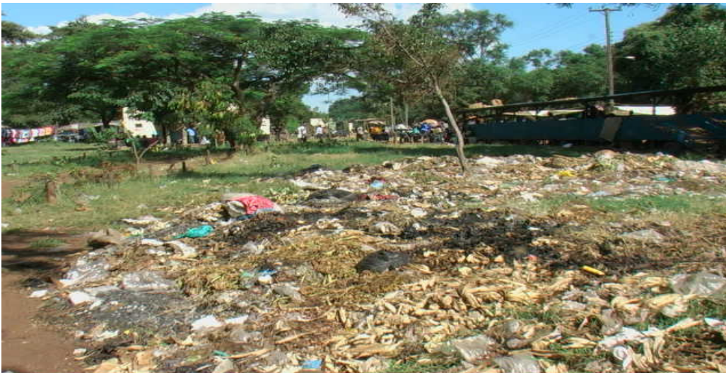
FIGURE 4: DUMPING SITE AT MARKET PARK

There were no signs of positive educational or environmental activities in Maendeleo, Taifa, Market and Jamhuri Parks despite there being a lot of potentials for these activities. There are several educational Institutions within Kisumu Town which could use the great educational resource potentials of urban Parks. Apparently this resource had not been well utilized or given due attention by these institutions. This was evident by the poor environmental conditions of most of the Parks. Learning institutions within the peripheries of the parks can contribute a lot in terms of dissemination of knowledge as well as maintenance of the Parks, but there was no evidence that they were involved with the parks. Due to the environmental condition of most of the urban parks, the environmental conservation benefits were greatly missed out. This was evident by the presence of litter and use of some Parks as dumping sites. Evident in Taifa, Market and Maendeleo Parks were plenty of litter and dumping sites within the Parks as seen in figure 4.