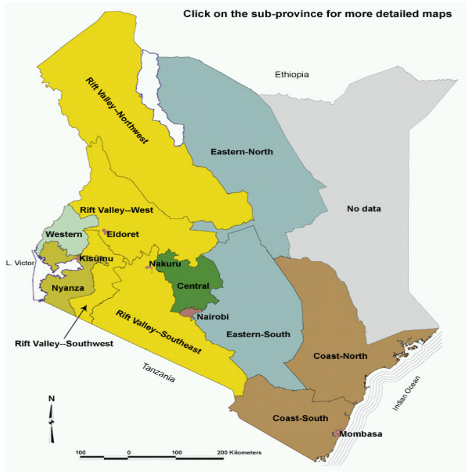
FIGURE 2: MAP OF KENYA SHOWING POSITION OF KISUMU TOWNSHIP

Milimani. The seven urban parks studied are found within these seven wards. The parks, include Uhuru Gardens, Jomo Kenyatta Ground, Jamhuri, Central, Taifa, Market and Maendeleo Parks.