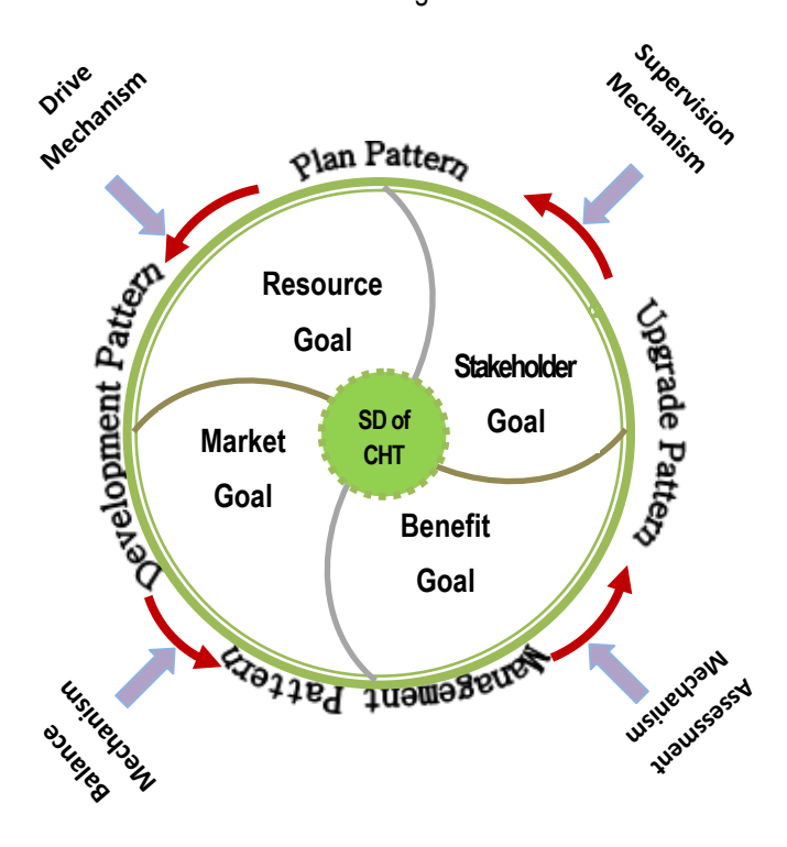
FIGURE 1 - THE INNER STRUCTURE OF SUSTAINABLE DEVELOPMENT OF CHT

In these related literature, it is apparent that at present the research concerned has involved many fields, including local people, resource protection, tourism management, benefit sharing, tourism planning, cultural inheritance, talent training, tourism marketing and other similar elements. Given the general rules of STD, the inner structure of STD in CHT basically consists of four dimensions, four goals, four patterns and four mechanisms as shown in Figure 1.