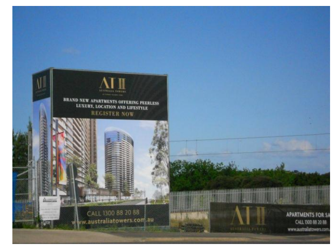
FIGURE 16 - PUBLICITY FOR BUILDINGS NEAR OLYMPIC PARK

To cater for the OG, the organizers also took circumstantial measures to reduce traffic, including decreeing a school holiday for the duration of the competition, changing workers' start and finish times, promoting distance working, informing users of peak traffic times and organizing campaigns to encourage use of public transportation instead of automobiles. As a result, the number of bus users per week fell to 3.2 million during the event, fewer than the corresponding figure for a normal August week in the same year -3.4 million passengers (Hensher; Brewer, 2002).