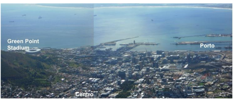
FIGURE 3 - GREEN POINT STADIUM SEEN FROM TABLE MOUNTAIN.

The stadium originally chosen for the FIFA 2010 World Cup games was the Athlone stadium, situated in a low-income district with a population of 128,000 predominantly black inhabitants and an unemployment rate of 28%. After South Africa had been chosen to host the games, the choice of stadiums was revised. In Cape Town activities were transferred to Green Point Stadium (Figure 3), located in an area with a population of 64,000 made up predominantly of whites, an unemployment rate of 6% and an average income four times that of Athlone (Swart, Bob, 2009, p. 119). The official reason for the change was that the new stadium was close to the city center, could be easily reached by tourists and was also close to beaches and other leisure facilities, such as the Victoria & Alfred Waterfront.