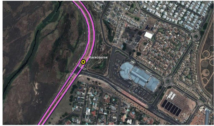
FIGURE 12 - SECTION BESIDE RACECOURSE STATION. Source: Google Earth, 2012.

In the same area, Figures 12 and 13 show that there are residential condominiums near Racecourse station, indicating the potential for integration between the transportation system and urban occupancy in the area. However, as can be seen from the pictures, these are not only medium- and high-quality condominiums, with lot sizes between 300 and 1,000 m2, but also relatively far from the stations, which are difficult to reach because of the road system.