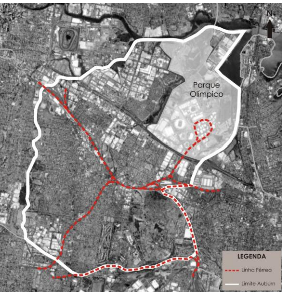
FIGURE 17 - THE AREA AROUND THE OLYMPIC PARK SHOWING THE LIMITED ACCESS TO THE SUBWAY AND RAIL NETWORK.

Cashman (2011, p.183) also notes that public transportation is inadequate in nearly all the towns in the vicinity of the park. Even in Auburn, where the Olympic Park is located, users have to travel more than two kilometers to a subway or rail station. Figure 17 shows that the lack of public transportation makes it necessary for people in the western part of Auburn to use their own vehicles to get to work. Furthermore, analysis of socioeconomic data shows that the population in municipalities farther from the city of Sydney has a greater percentage of unemployed parents. As they are unable to acquire their own automobile or use public transportation, it is difficult for them to go to other areas.