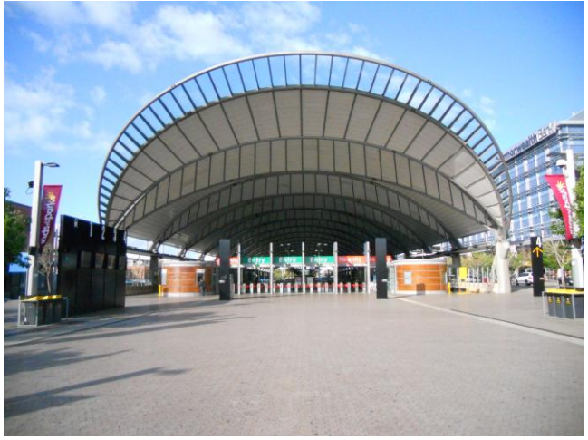
FIGURE 15 - OLYMPIC PARK RAIL LOOP STATION.