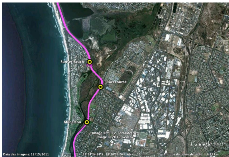
FIGURE 10 - SECTION BETWEEN MILNERTON AND SUNSET BEACH STATIONS.

Another example of the failure to consider land use and occupancy when planning the BRT can be observed between Milnerton and Sunset Beach stations (Figures 10 and 11).