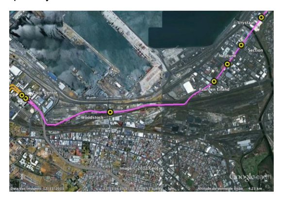
FIGURE 6 - THE SECTION BETWEEN WOODSTOCK STATION AND SECTION STATION. Source: Google Earth, 2012

A more detailed analysis of the section between Central Station and Table View reveals that the population density along the corridor is extremely low. Figures 6 to 9 show that the area between Woodstock and Section is occupied by factories and warehouses.