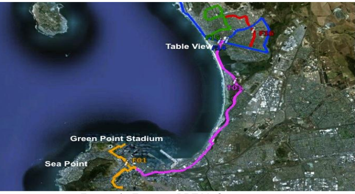
FIGURE 4 - EXISTING BRT MYCITI LINES.