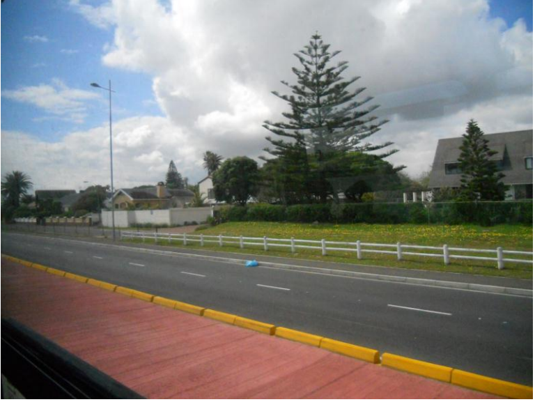
FIGURE 13 - OCCUPANCY BESIDE RACECOURSE STATION.