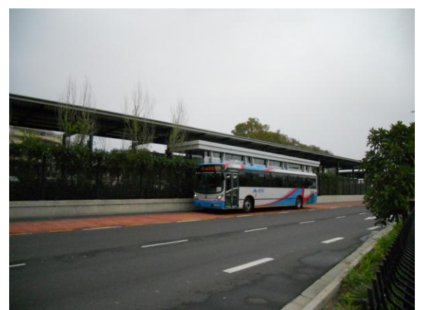
FIGURE 5 - A MYCITI STATION, SHOWING THE EXCLUSIVE CORRIDOR.

It is the third axis, which goes from the centre of Cape Town to Table View, that most closely resembles a BRT. On this section, which is approximately 16 km long, buses circulate in separate corridors; the thirteen stations are long, allowing all the doors on the buses to be used for passengers to board and alight; the fare is paid in advance; and the corridor is made of concrete so that buses can travel faster and are safer and more comfortable (Figure 5). There are feeder lines from the terminus at Table View that feed passengers from different districts into the system.