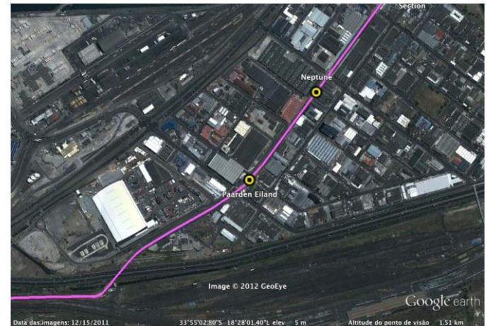
FIGURE 8 - DETAIL OF THE AREA NEAR PAARDEN EILAND AND NEPTUNE STATIONS.