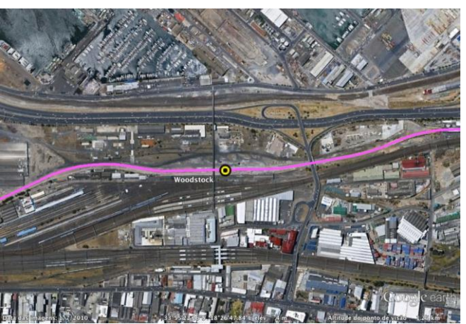
FIGURE 7 - DETAIL OF THE AREA NEAR WOODSTOCK STATION