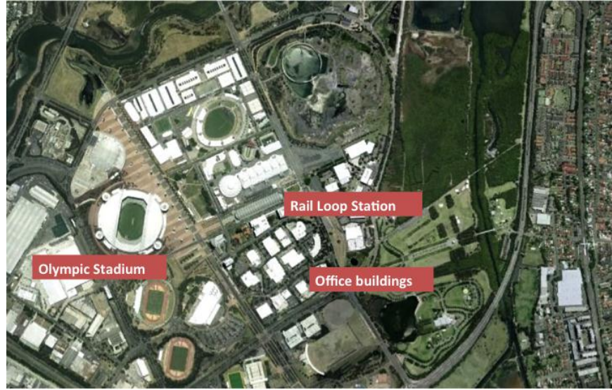
FIGURE 14 - OLYMPIC PARK, STATION AND COMMERCIAL AND RESIDENTIAL AREAS.

Because it provides for a high-capacity transportation system and stimulates construction of tall mixeduse (but primarily business-use) buildings through changes to zoning, the transportation project for the Olympic Park has the characteristics of a nodal TOD.