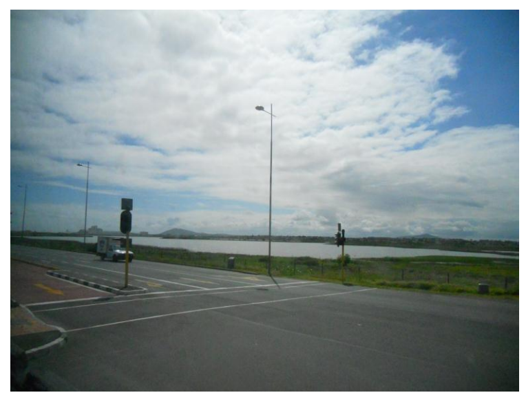
FIGURE 11 - OCCUPANCY BESIDE MILNERTON STATION.