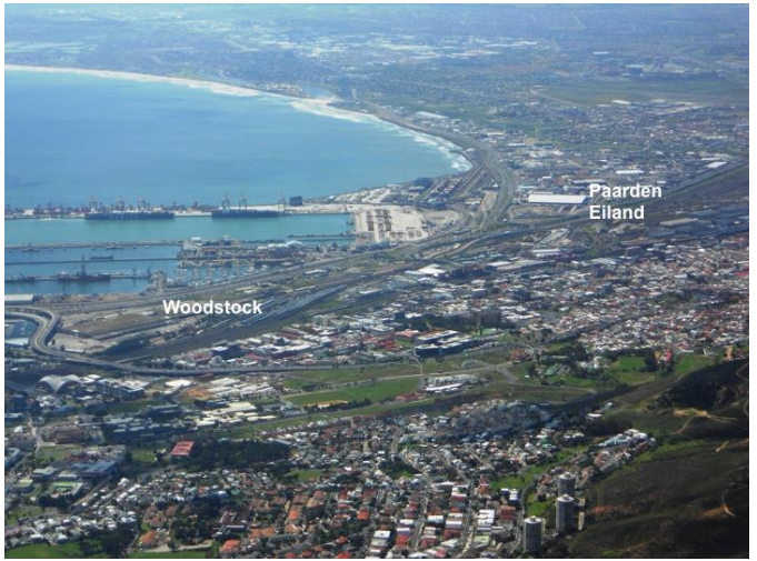
FIGURE 9 - AERIAL VIEW OF THE AREA NEAR WOODSTOCK AND PAARDEN EILAND STATIONS.